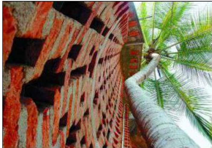
A view of the Centre for Development Studies, Thiruvananthapuram, which Baker designed. He had a deep, genuine concern for nature and trees.

I used to meet Baker at times. But it was still a very distant relationship. I was never really close to Baker then. I decided I needed to study more and chose to go abroad for my masters. Once again Baker became the inspiration. I studied at the very same school where Baker had once been a student (in 1937), the Birmingham School of Architecture. As I was leaving for England, Baker gave me a reference letter, in which, among other things, he said of me, "I know of no other young person in India who can take this technology forward." To me, it was a blessing from a great master, which came quite early in my career.